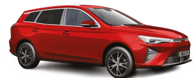
DYNAMIC RED TRI-COAT PAINT*

*Tri-coat and metallic paint optional at extra cost.