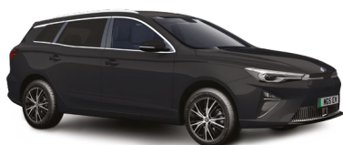
BLACK PEARL METALLIC PAINT*