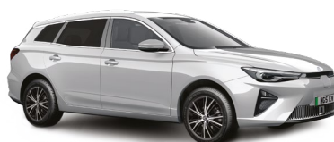
COSMIC SILVER METALLIC PAINT*