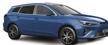
PICCADILLY BLUE METALLIC PAINT*