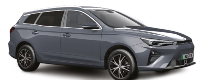
HAMPSTEAD GREY METALLIC PAINT*