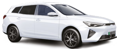
ARCTIC WHITE STANDARD PAINT